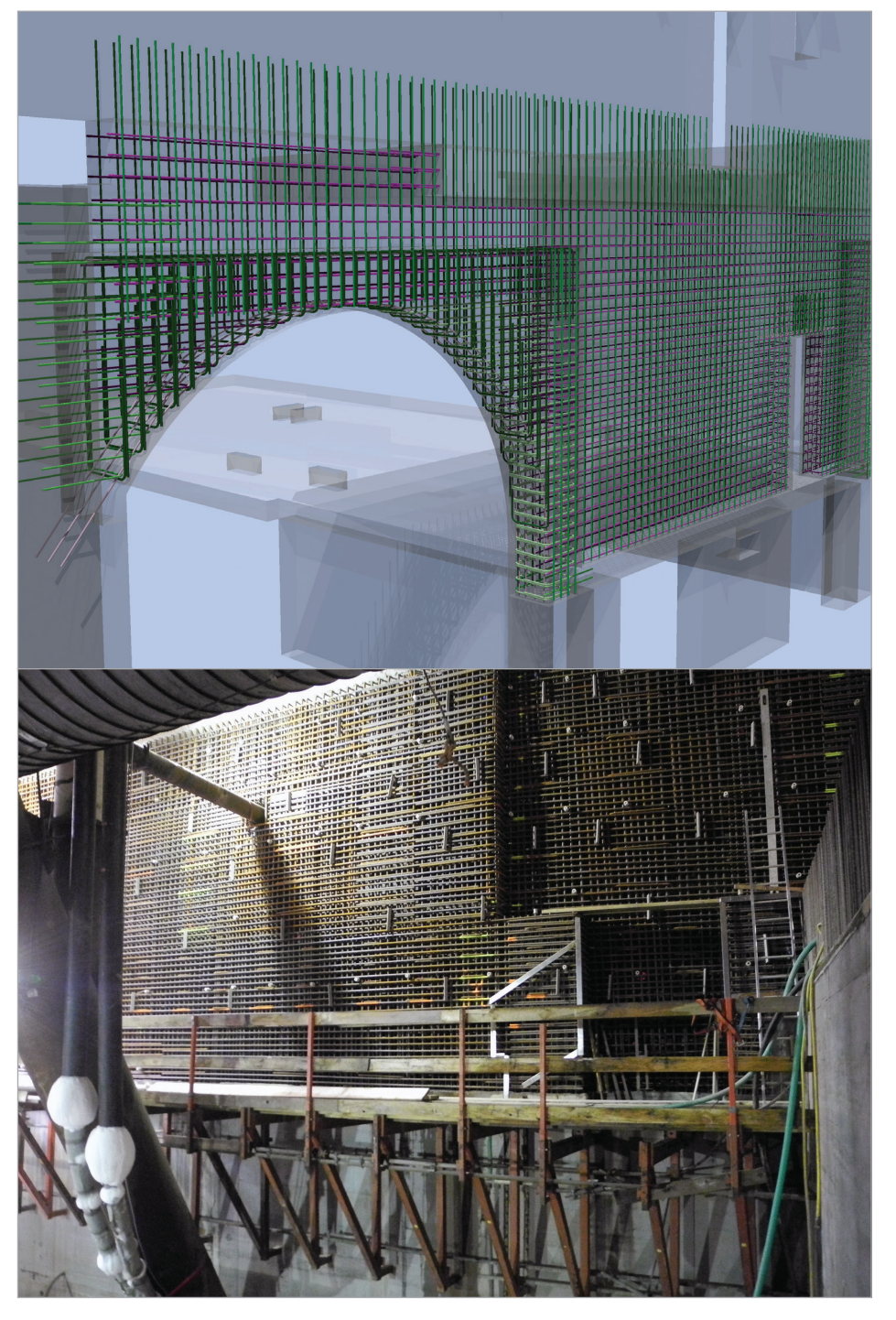
Nemetschek Structural User Contest 2013 - Category 2: Civil Structures

Royal HaskoningDHV is responsible for the detailed engineering of Rokin station. A 3D model of the station is made, which includes all temporary works. In order to make detailed reinforcement drawings, elements from the model are exported to 3D Allplan. The realistic 3D overview increases the quality of the reinforcement drawings, thus reducing the error rate. Whenever possible, intelligent copy and move tricks are used. Bar bending schedules, including support reinforcement, are directly available to the contractor. In general, the use of 3D Allplan contributes to a more efficient execution of the project.