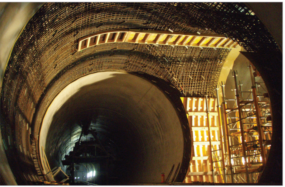
Nemetschek Engineering User Contest 2011 - Category 2: Civil Structures