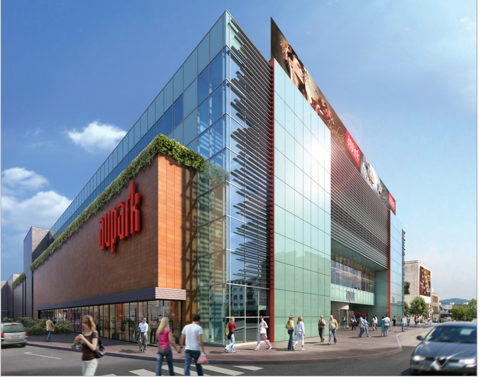
Nemetschek Engineering User Contest 2011 - Category 1: Buildings